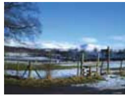
The Pennines, near Appleby

Not all stations are suitable for wheelchairs. Please phone the disabled travellers helpline 0845 600 8008 before travelling.