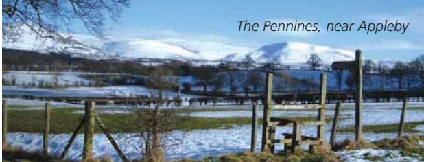
The Pennines, near Appleby