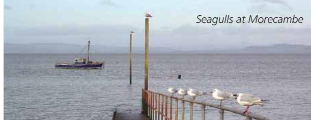
Seagulls at Morecambe